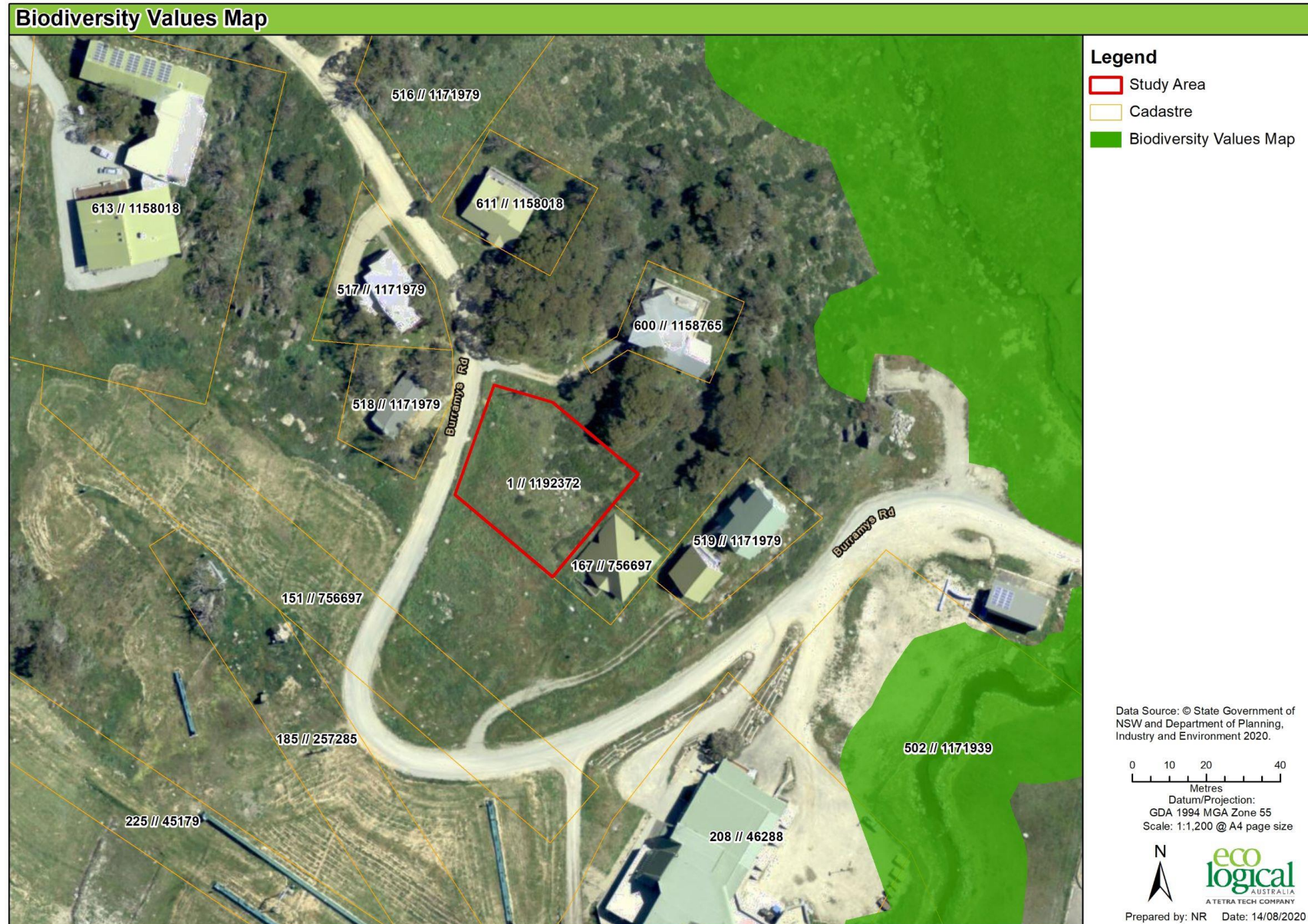
Figure 1: The proposed development in relation to the Biodiversity Values mapping.