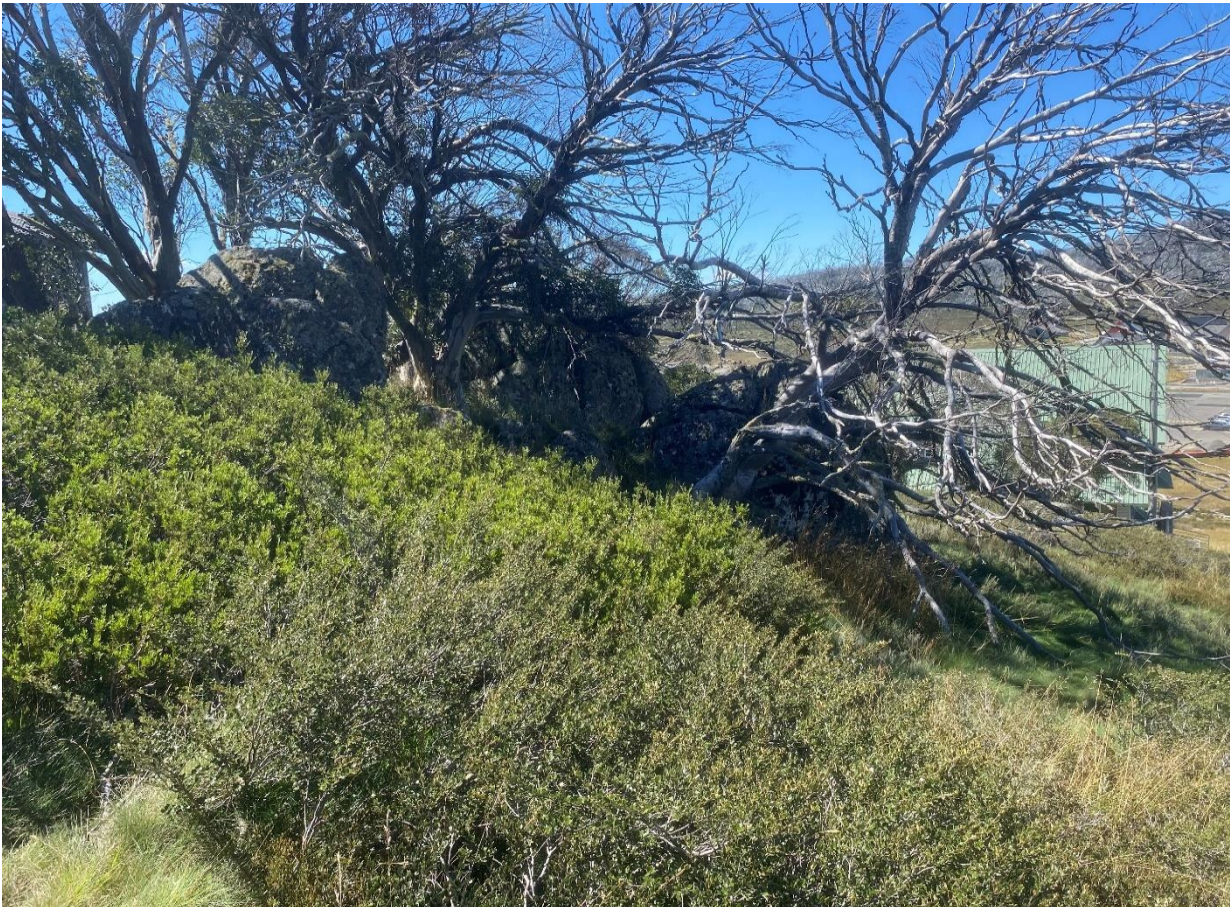
Photo 4: The dieback affected trees on the margins of the proposed APZ will be removed or heavily pruned. As such there will very little tree canopy within the proposed APZ.