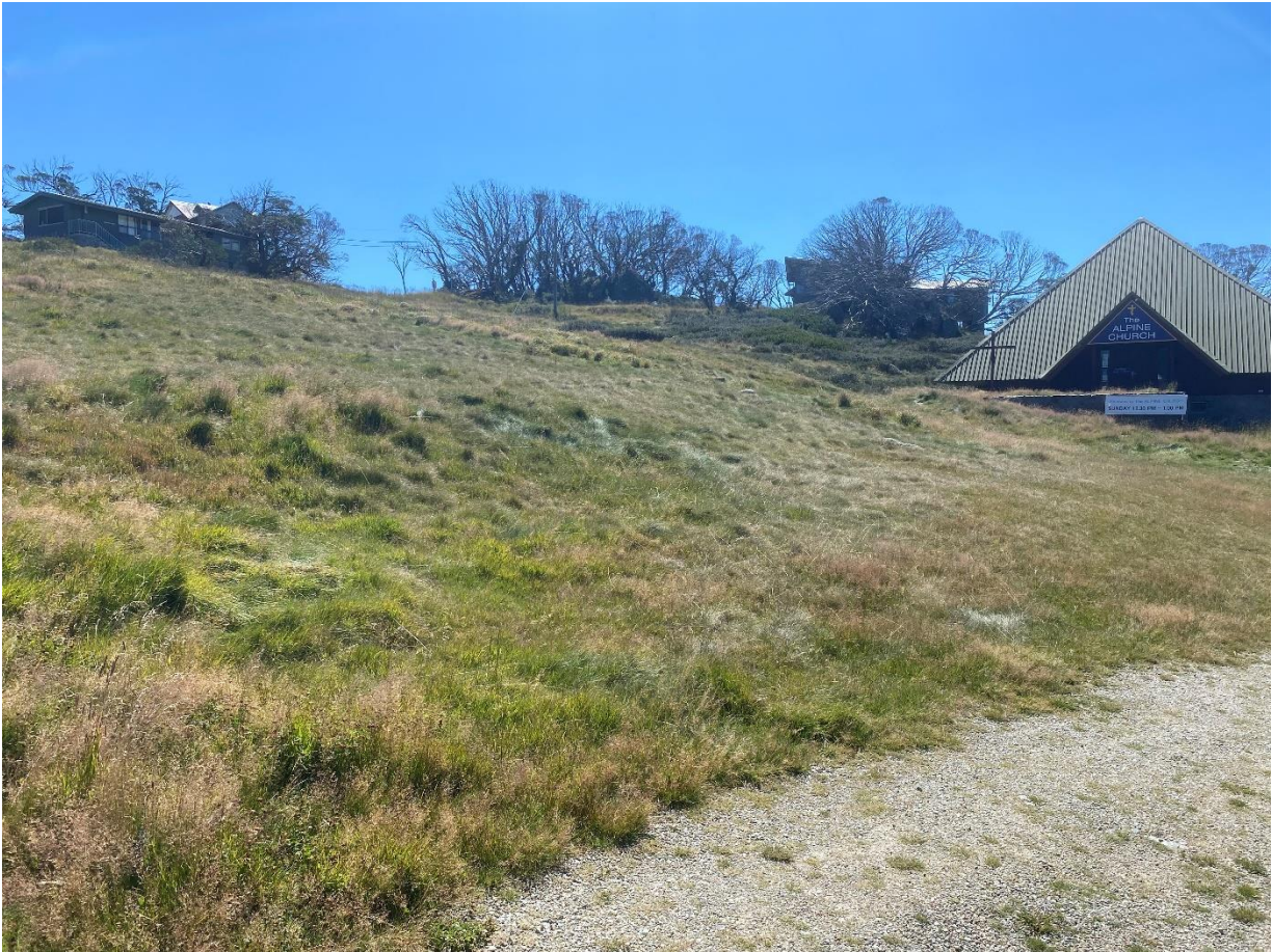
Photo 1: Looking north to the subject land showing the route of the proposed driveway and stormwater.