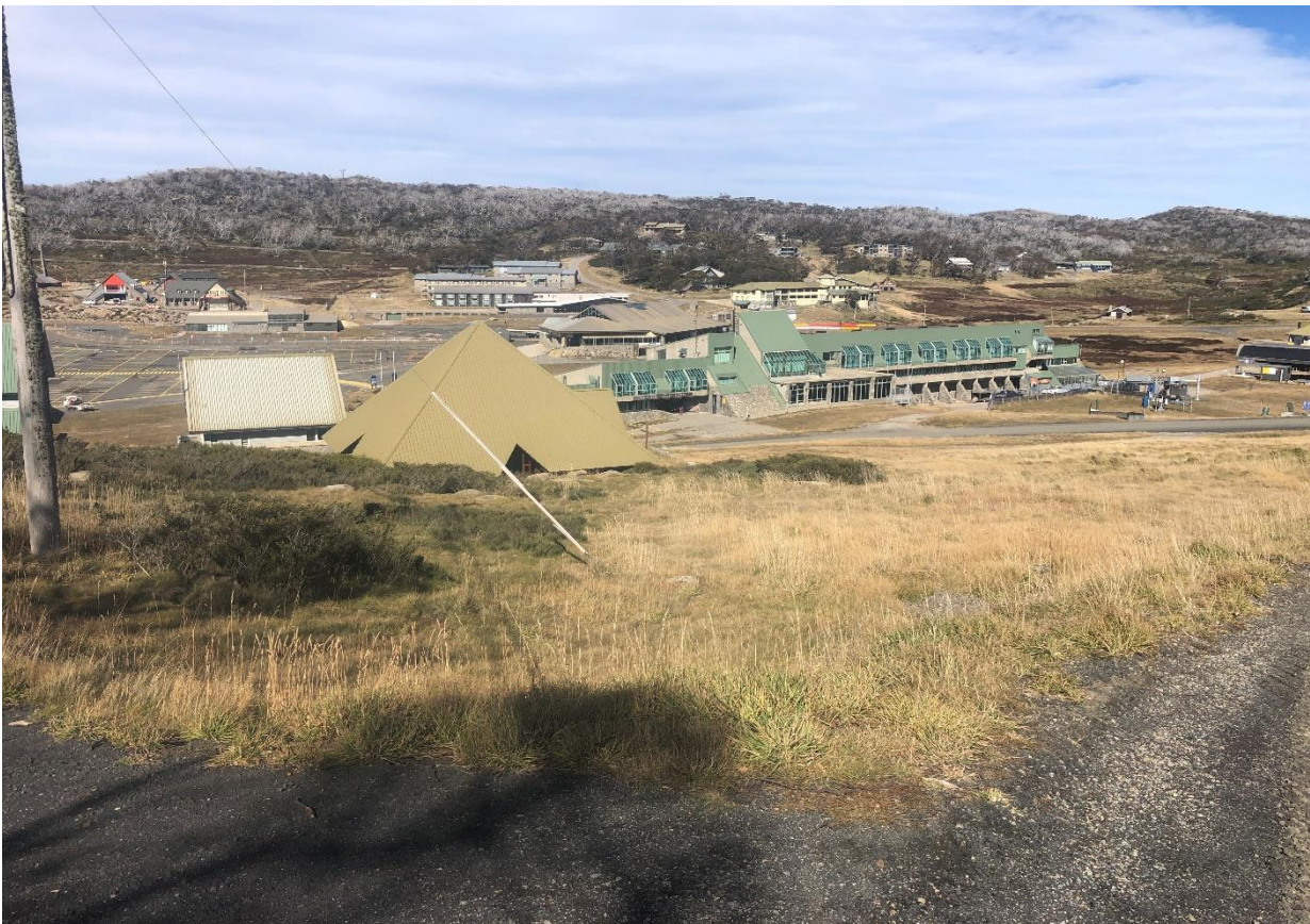
Photo 2: Looking southeast from the north-western corner of the subject land.