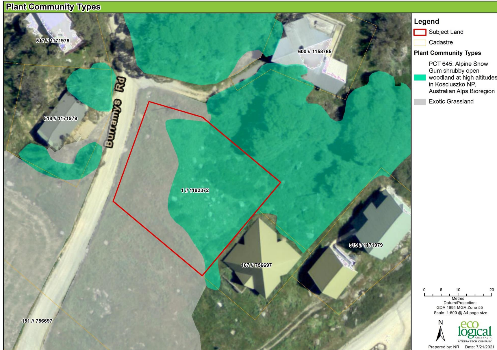
Figure 5: Vegetation communities within the subject land