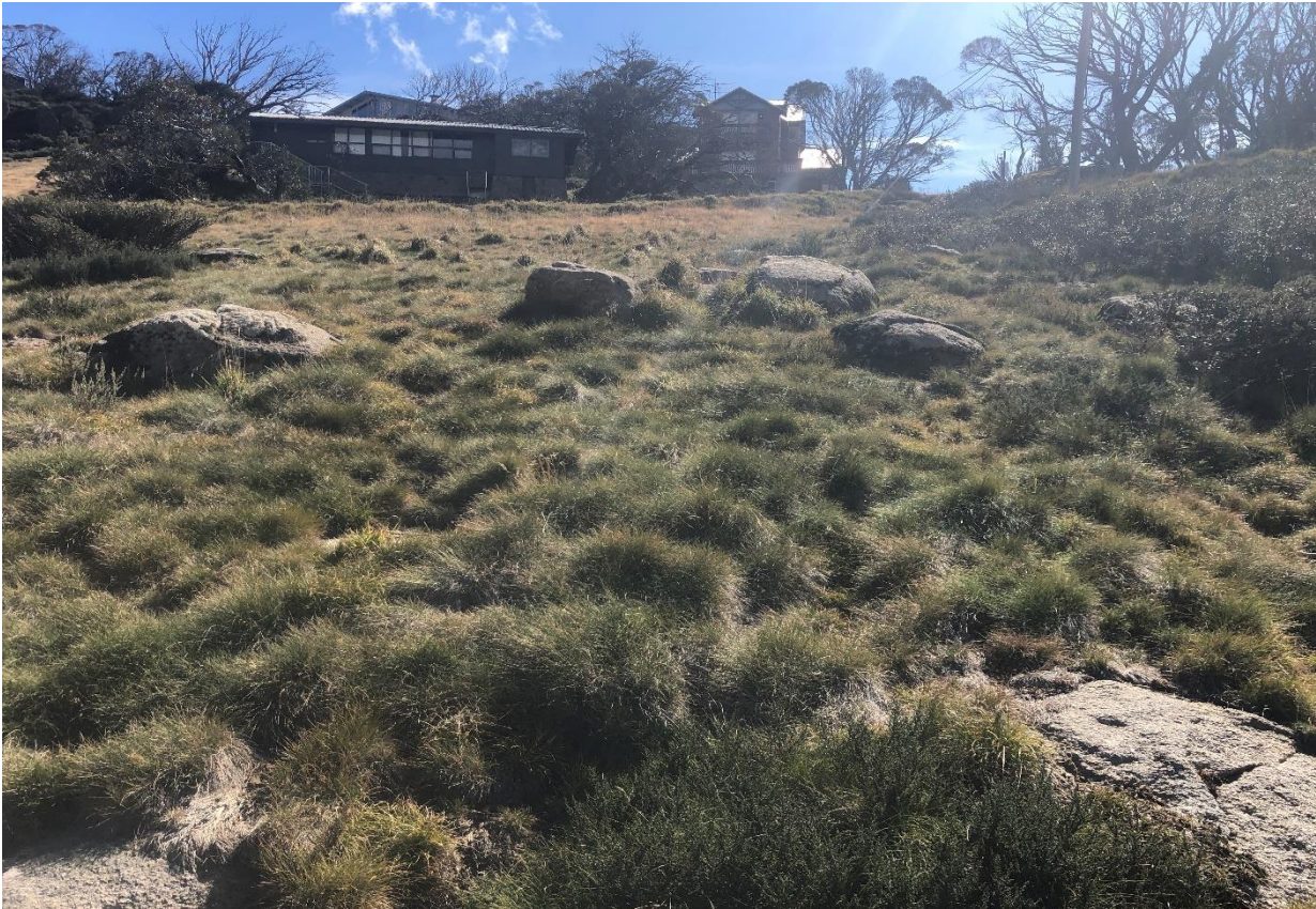
Photo 5: The limited rock habitats within the development site are generally not suitable for the Guthega Skink.