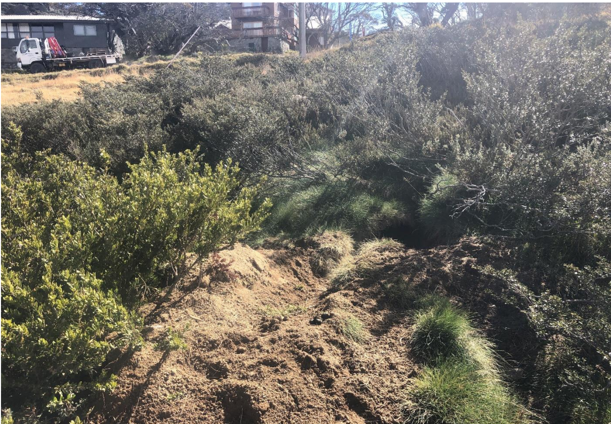
Photo 6: An active Wombat burrow occurs in the northern parts of the development site.